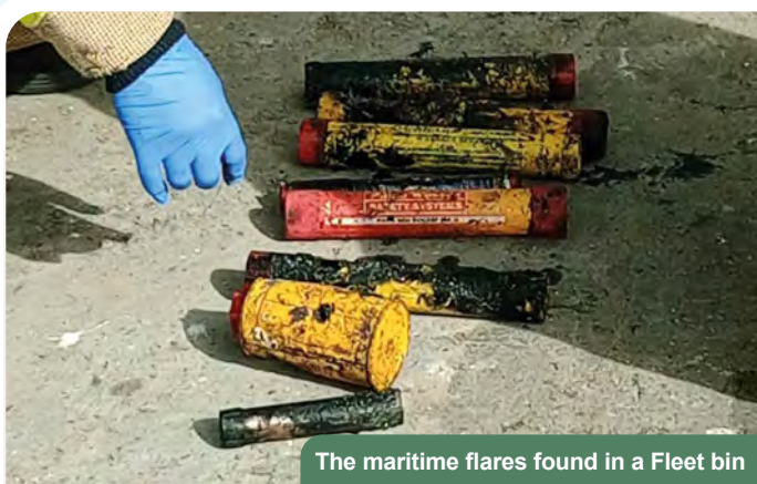
The maritime flares found in a Fleet bin

Pay attention to the present moment. As well as events at our countryside sites, we offer a mindful nature walk trail at Fleet Pond and a mindful nature walk guide for use in any green space. Visit www.hart.gov.uk/mindful-nature-walk for more information.