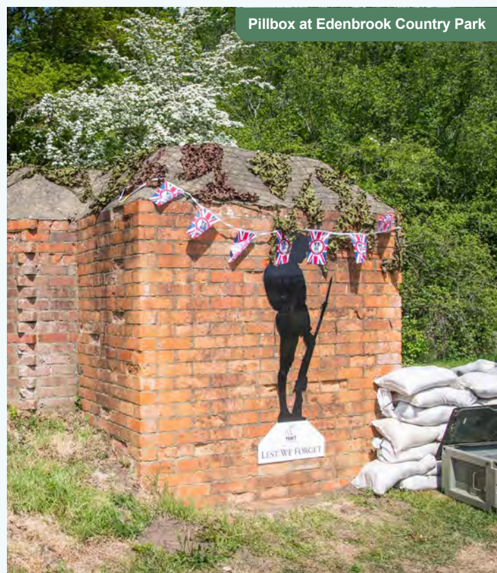
Pillbox at Edenbrook Country Park

To mark VE Day, these monuments were given a new set of explainer boards telling their story. So next time you're strolling through the park, why not take a look. There are also plenty more pillboxes around the district including along the Basingstoke canal and in Ewshot. How many do you know of?