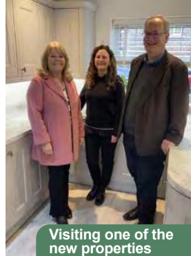
Visiting one of the new properties