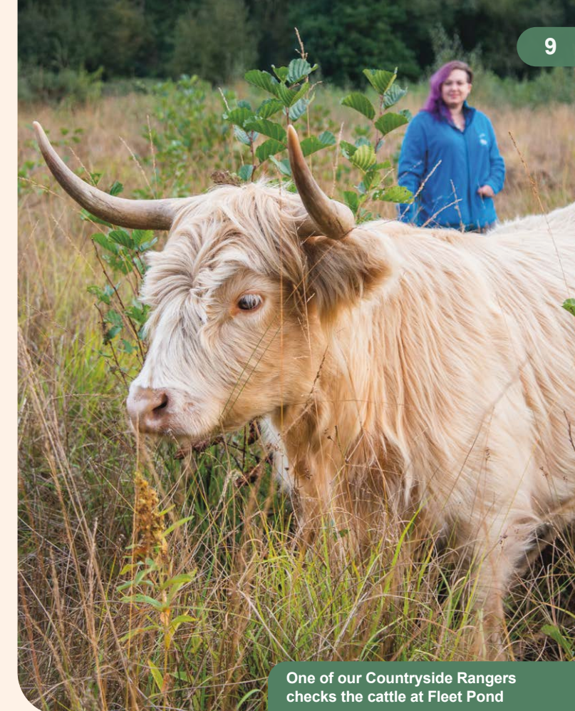
One of our Countryside Rangers checks the cattle at Fleet Pond

Conservation grazing is tough, and the cows selected are well adapted to cope with the challenges like extreme weather conditions, a range of terrains and winter weight loss when vegetation decreases. Most commercial breeds would struggle in these conditions so it's not easy to find herds available to conservation graze.