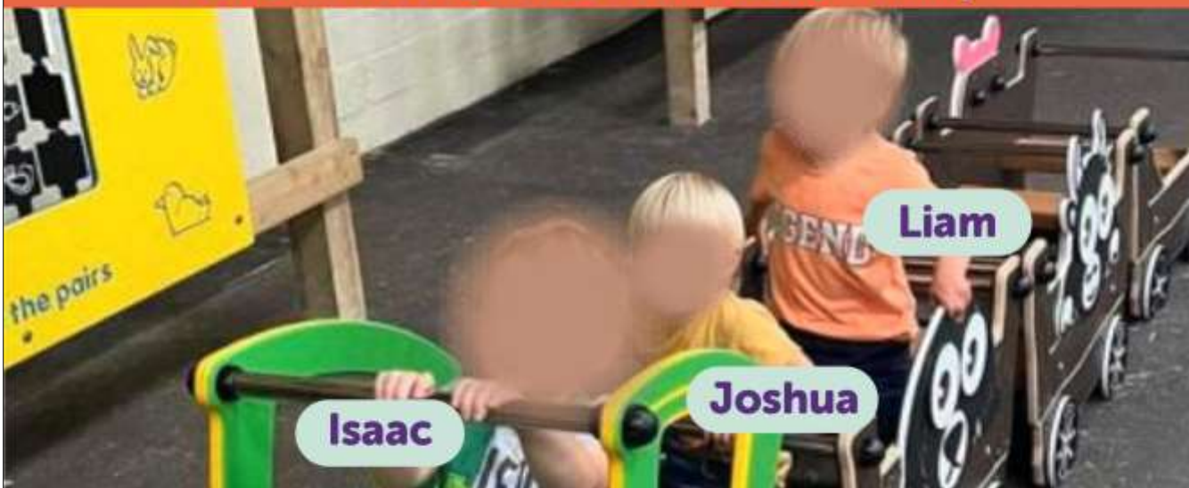
*The names of the children have been changed to protect their identity

There are children in our region who need to feel loved and cherished in a forever family