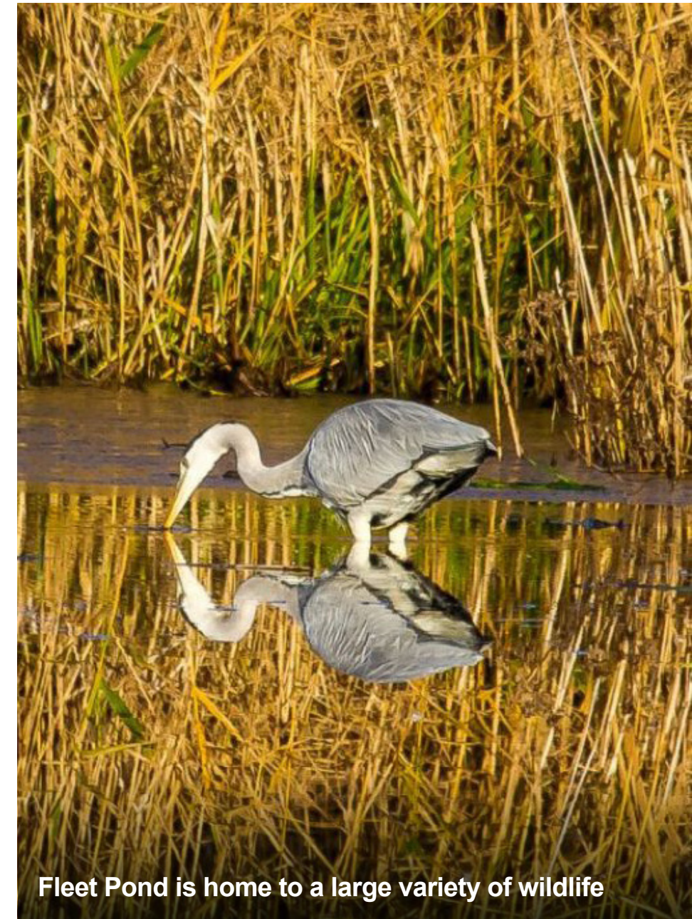
Fleet Pond is home to a large variety of wildlife

Fleet Pond Society will be carrying out an extensive programme of conservation tasks, working with Hart Countryside Service. This will run right through the autumn and winter up to the breeding season in spring. Volunteers who'd like to help should contact: volunteers@fleetpond.org.uk .