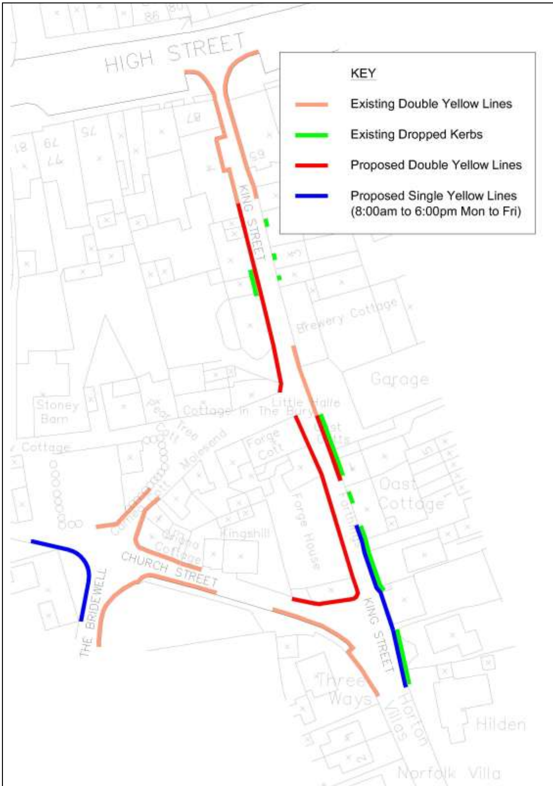
Figure 2: Proposed King Street restrictions