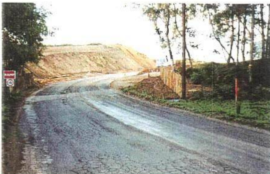
Mineral extraction at Heath Warren