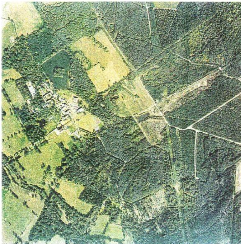
Parkland and forest landscapes near Bramshill