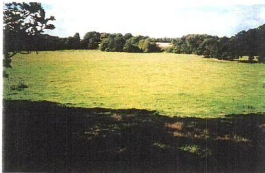
Mixed farmland and woodland near Bramshill