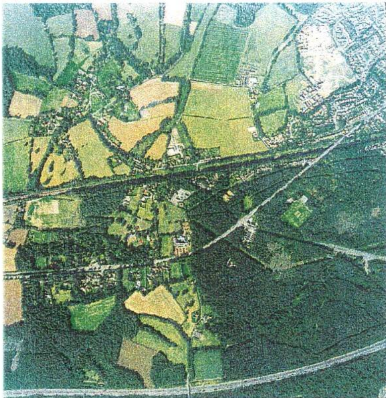
Mixed heathland and woodland at Hook Common