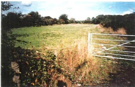
Mixed farmland and woodland with fringe character near Hook