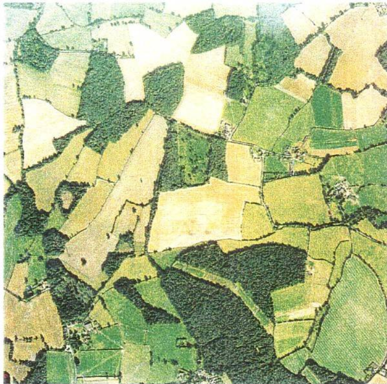
Mixed farmland and woodland near Chandlers Green