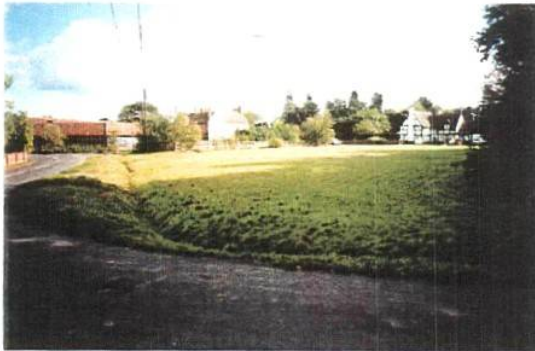
Village green and traditional buildings at Mattingley