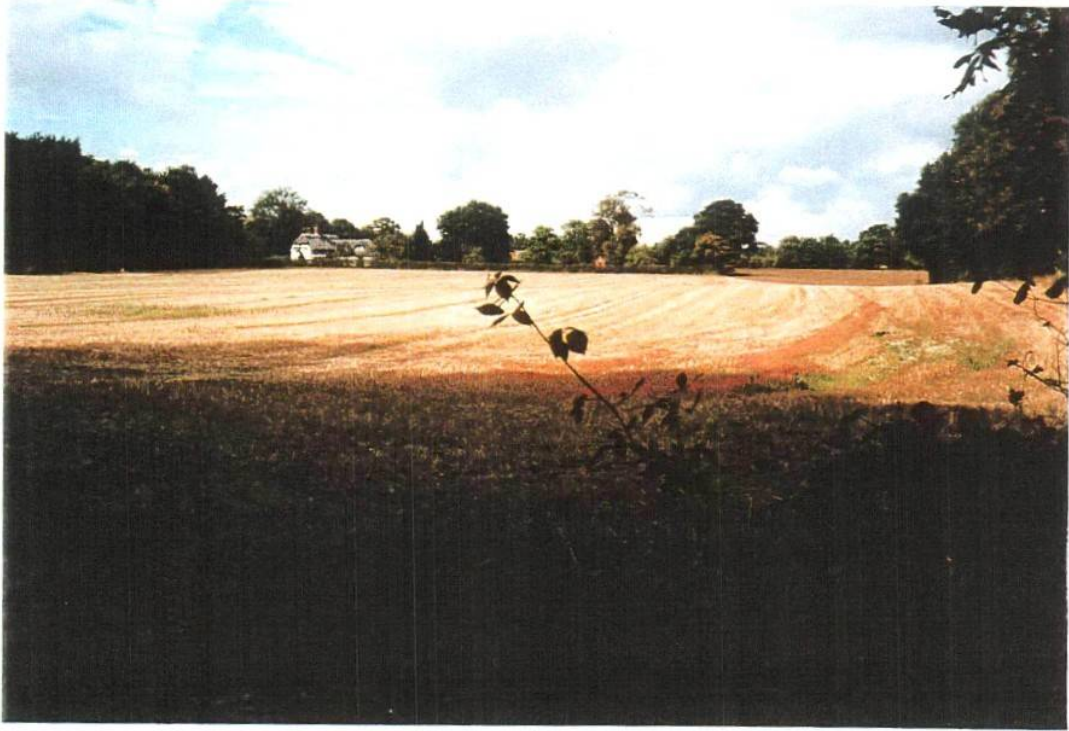
Mixed farmland and woodland near Chandlers Green