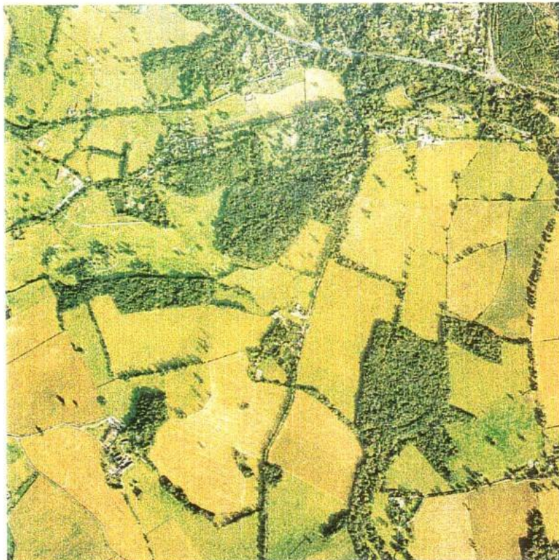
Mixed pasture and woodland around Warren Corner