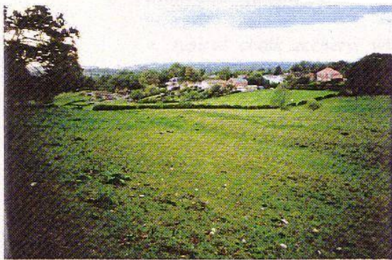
Mixed farmland and woodland with fringe character, near Ewshot