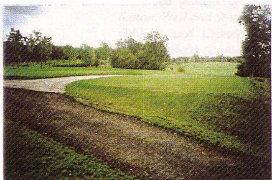
Golf course landscape at Crondall