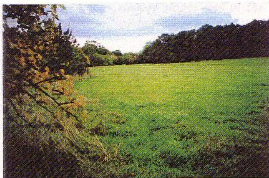
Mixed pasture and woodland (small-scale) near Ewshot