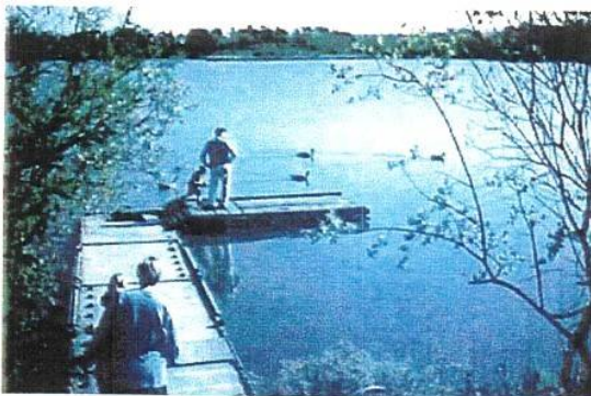
Wetland landscape at Fleet Pond