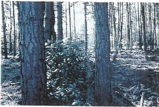
Forest and heath around Tweseldown Hill