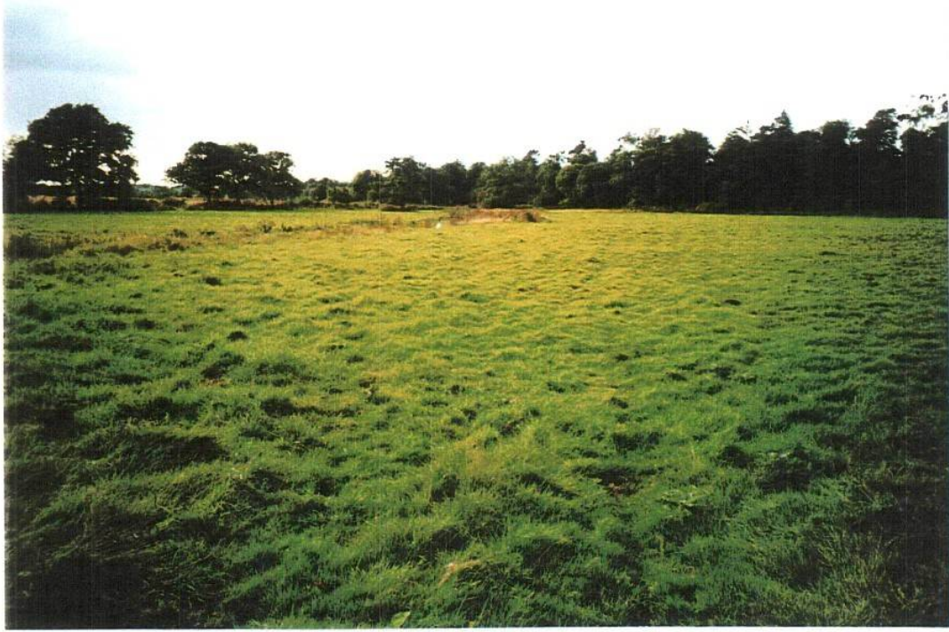
Floodplain farmland near Winchfield Hurst