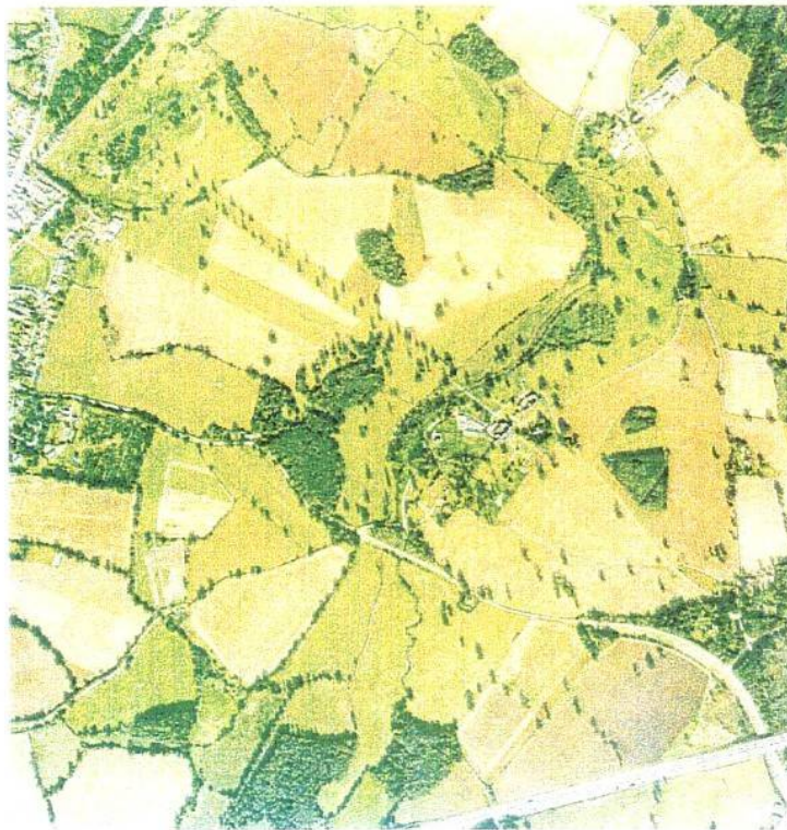
Parkland and floodplain farmland around Elvetham Hall