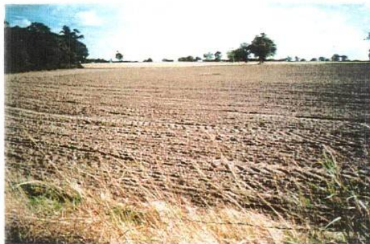
Open arable farmland near Elvetham Hall