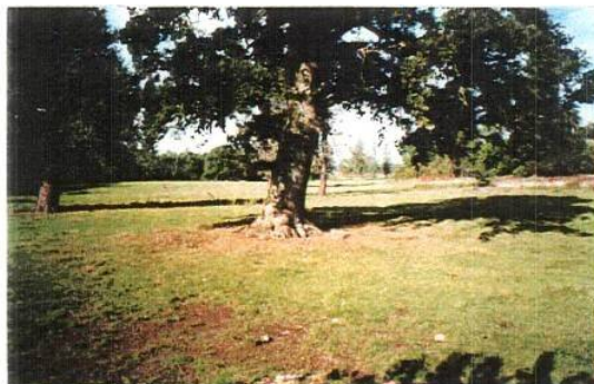
Remnant parkland at Elvetham Hall