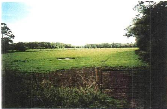
Mixed farmland and woodland near Hartley Wintney