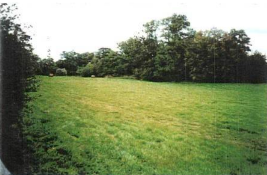
Mixed farmland and woodland near Coxmoor Wood