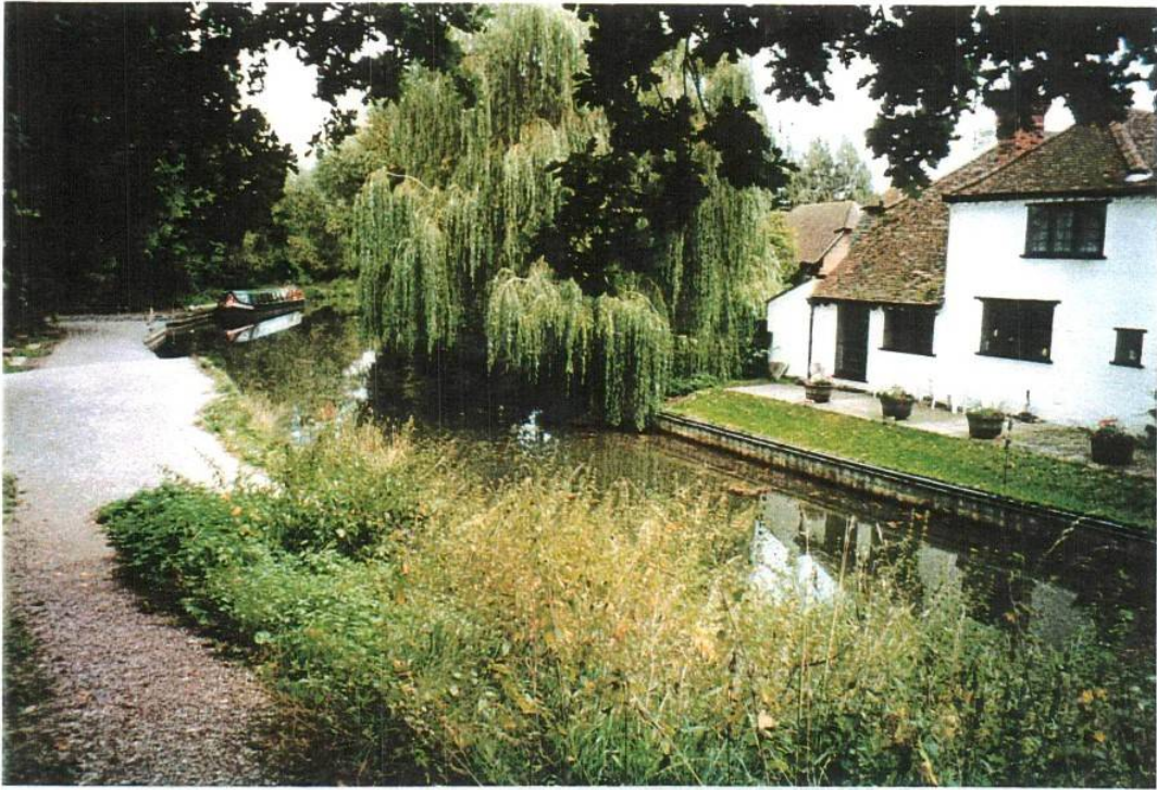
Basingstoke Canal near Winchfield Hurst