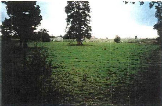
Remnant parkland at Dogmersfield