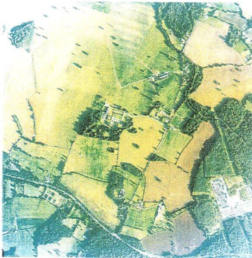
Parkland at Dogmersfield