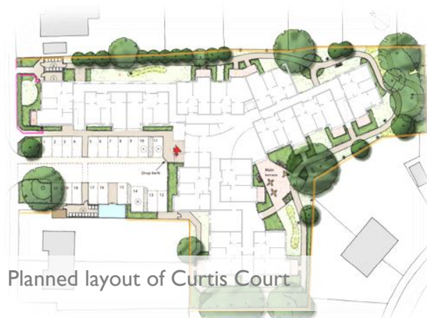
Planned layout of Curtis Court