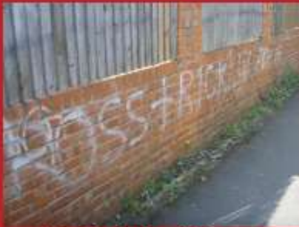
Beaulieu Gardens, Blackwater

If you know who is responsible please ring Hart District Councils Anti-social Behaviour Line on 01252 774256 or Crimestoppers anonymously on 0800 555 111.