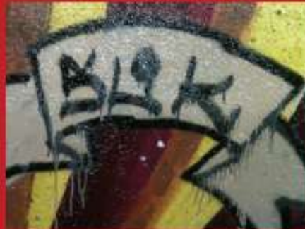
St Johns Close, Hook