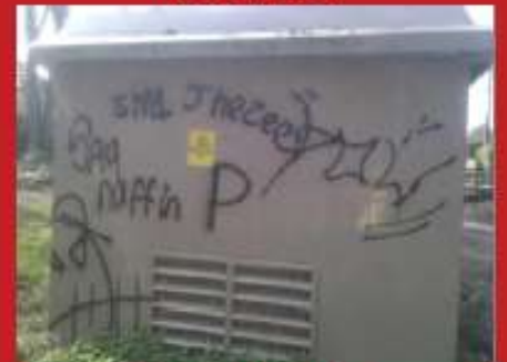
Granford Avenue, Fleet