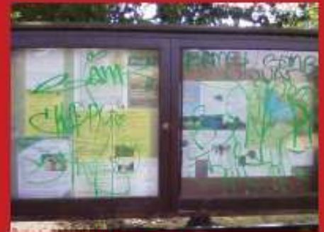
Fleet Pond, Fleet