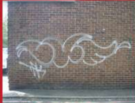
London Road, Blackwater