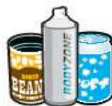
food tins, drink cans & aerosols

Please remember to only put the following in your recycling bin :