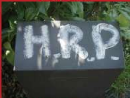
Gab Farm Close, Blackwater