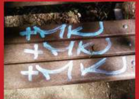
Fleet Pond, Fleet