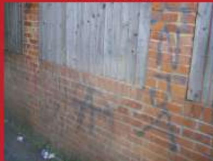
Beaulieu Gardens, Blackwater