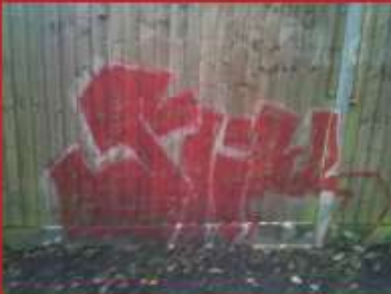
Raven Road, Hook