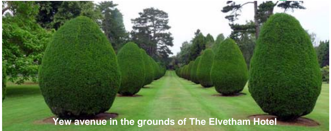
Yew avenue in the grounds of The Elvetham Hotel