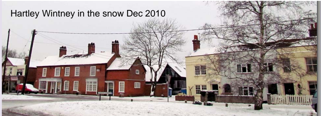
Hartley Wintney in the snow Dec 2010